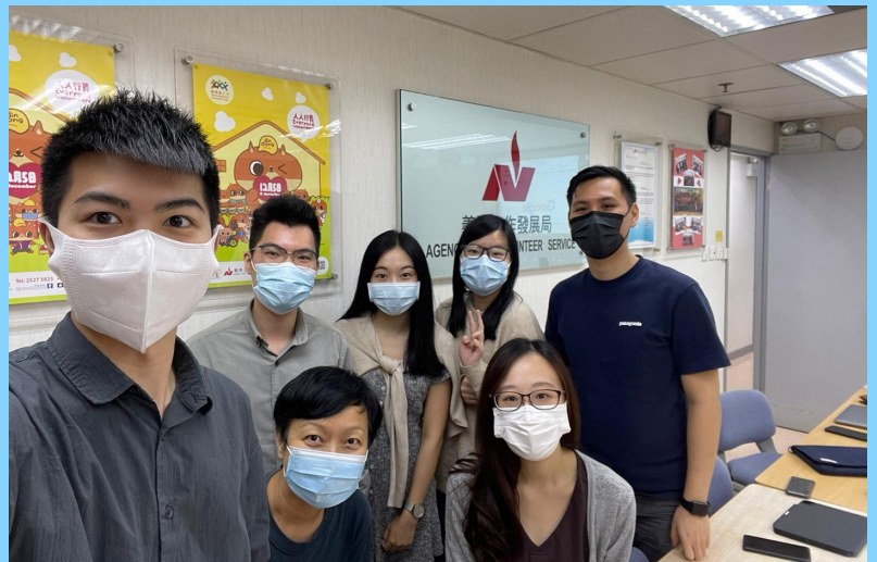
Members of the Executive Committee at the AGM

Taking into consideration the prevailing social distancing measures, the Society will continue to explore opportunities to engage members and promote United Nations values via different means.